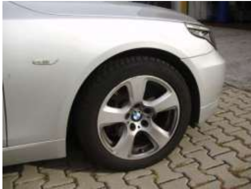
Element: Scratch on rim