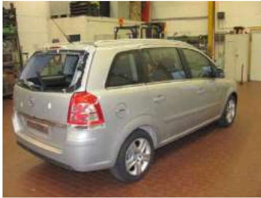
Element: Rear window