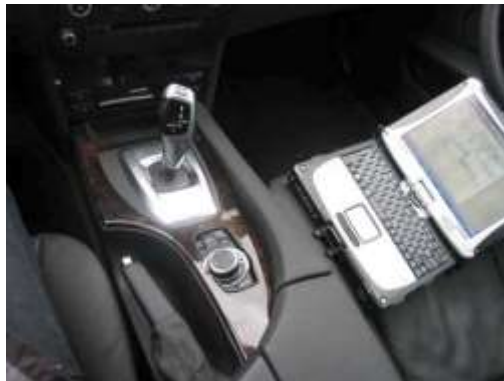
Element: Adjustment panel