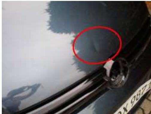
Element: Engine bonnet